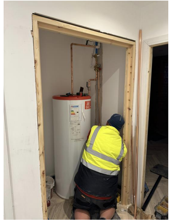
Heaters Being Installed