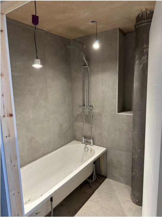
Second fix Electrics going in Bathrooms