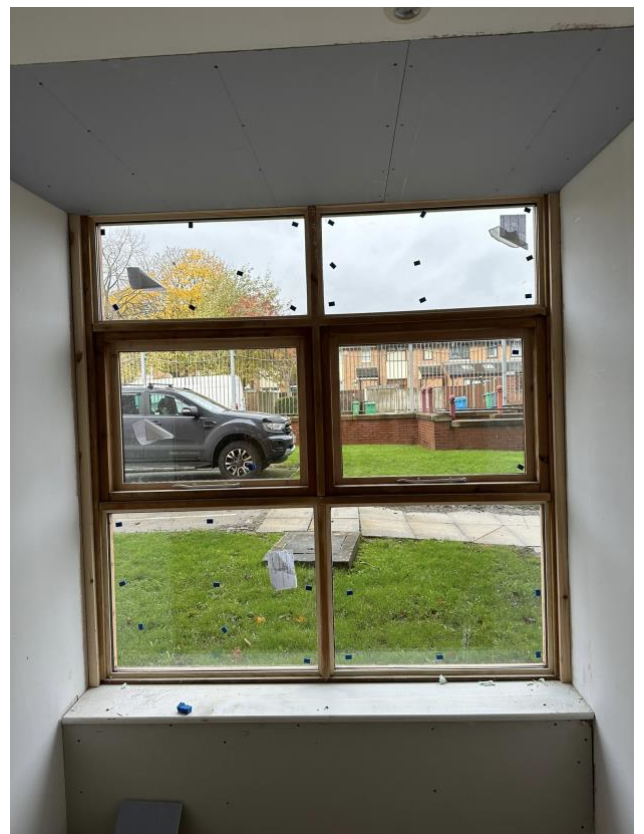
Double Glazed window installation