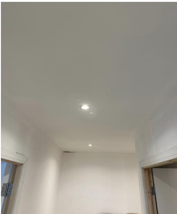
Second fix Electrics going in