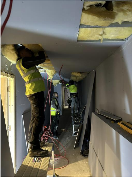
Plasterboard Being fitted