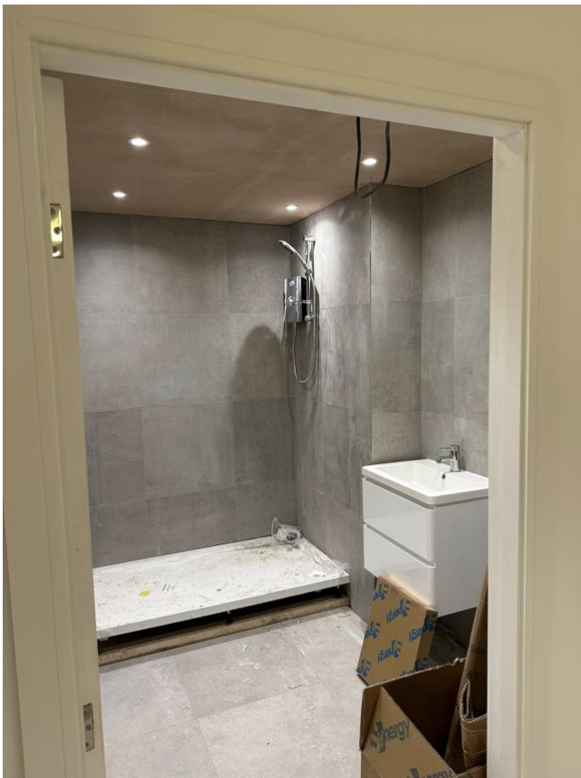
Tiling Being Completed