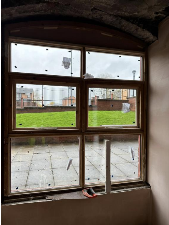
Windows Crafted and fitted by local company.