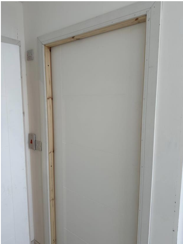
Internal Doors going in