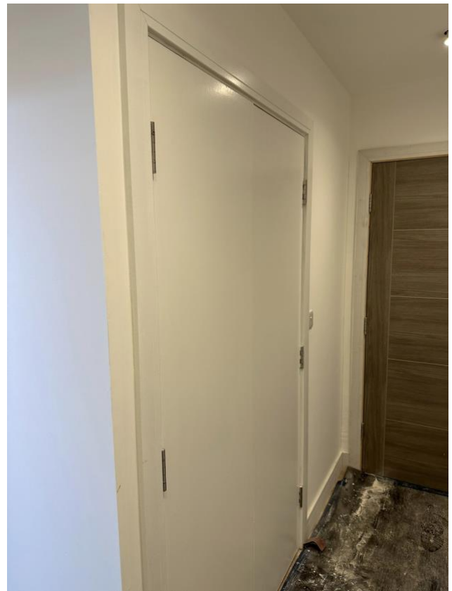
Fire Doors fitted in Corridors